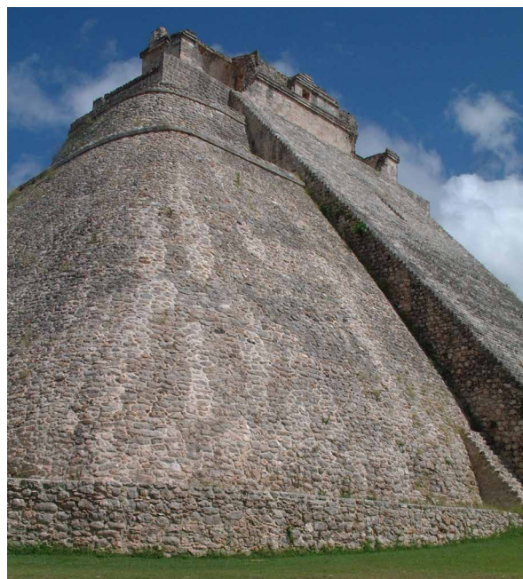
Pyramid of the Magician - Uxmal by Laura Vick

Set out with a boxed breakfast for birding at Calakmul Biosphere Reserve this morning. Calakmul is part of the largest extension of tropical forest outside the Amazon Basin and is home to many endangered mammals and an impressive 350 bird species. Within the reserve is the Calakmul archaeological site; the top of the complex’s great pyramid offers a good vantage point to look for soaring raptors, such as Hook-billed and Gray-headed Kites, Hawk Eagles, and the magnificent King Vulture, which is the symbol of Calakmul. Other possibilities include regional endemic species such as the Ocellated Turkey and Rose-throated Tanager, as well as vulnerable birds like the Great Curassow.