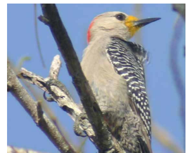
Yucatan Woodpecker