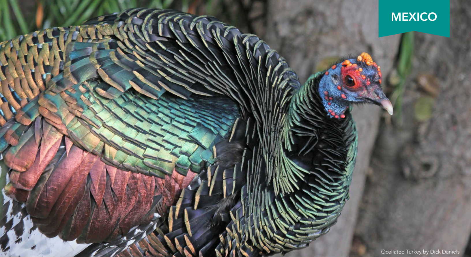
Ocellated Turkey