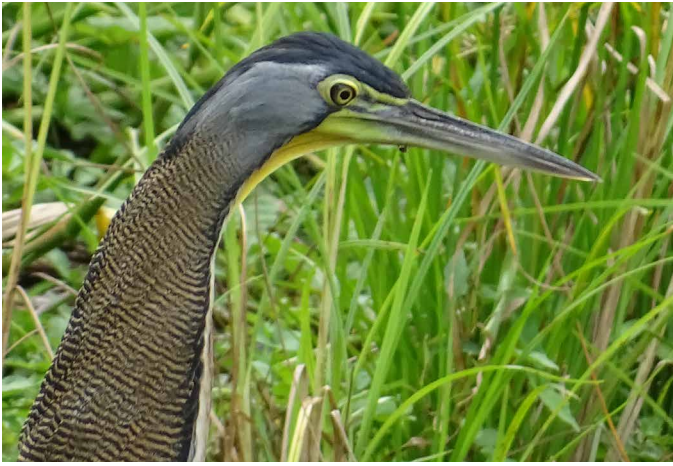
Bare-throated Tiger-Heron

Have a picnic lunch before returning to the hotel for more birding around the hotel gardens this afternoon before dinner. Overnight at Chicanna Ecovillage Resort. (BLD)